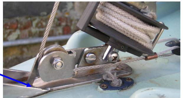
Nose fits into 5mm hole (not as shown)

The plate is also manufactured with slotted holes to attach to the forestay plate of your Squib. The Squibs I have measured have either 22mm or 18mm hole centres depending upon whether you have a low or high number boat. The plate is shown here. Note - If your forestay plate looks different to the photos the furling plate may need to be drilled specially. If so can you make a cardboard template by placing a flat edge against the top of the bowplate and drawing round the forestay plate and marking the 2 holes.